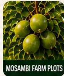
MOSAMBI FARM PLOTS