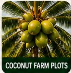
COCONUT FARM PLOTS