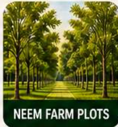
NEEM FARM PLOTS